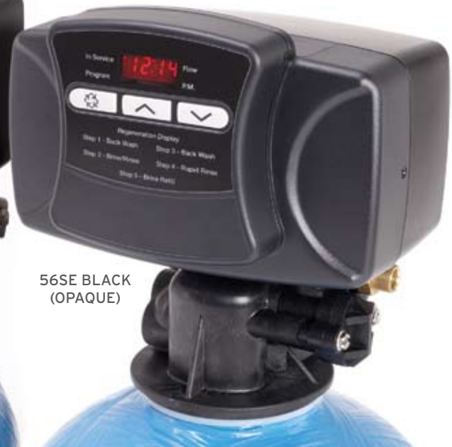
56SE BLACK (OPAQUE)

Introducing a new range of covers for 5600 Mechanical and 56SE Control Valves, FLECK's most popular residential models