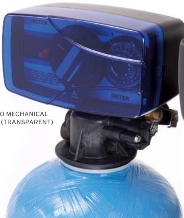
5600 MECHANICAL BLUE (TRANSPARENT)