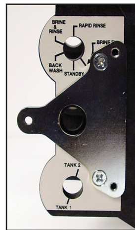
Old Label with Service Kit Ground Plate Mounted