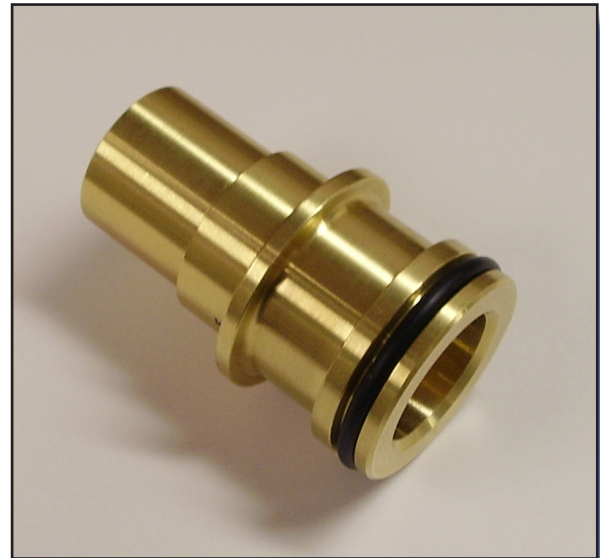
61626 Connector Assembly