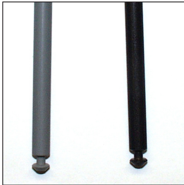
Old Color (Grey) on Left and New Color (Black) on Right

The color on the 2850 piston Rod (p/n 16436, and by-pass piston assembly p/n 60105) is changing from grey to black. The reason for the change is for easier part differentiation, and it will be changed as inventories are depleted.