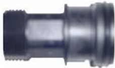
40563-01 Plastic 1" Connector NPT (W/O-ring) 40563-11 Plastic 1" Connector BSP (W/O-ring)